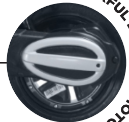
POWERFUL ELECTRIC MOTOR