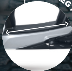
LONG LEG ROOM