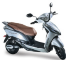
BLUISH PEARL WHITE